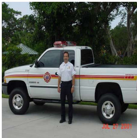
SPECIAL OPS NEWS

I want to thank everyone who indicated an interest in being on the team. Some of you were not chosen due to the size of the team, but we will keep your name for the future.