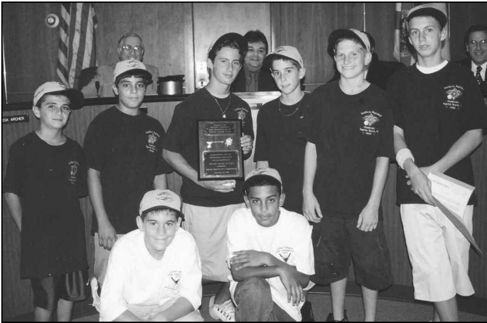
The East Boynton Beach Little League National Champions were given the Key To The City by the Mayor and Commissioners of Delray Beach at their meeting, September 23rd, in Commission Chambers at Delray Beach City Hall.