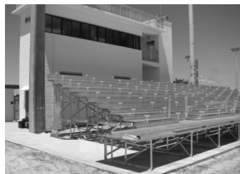
Newly installed bleachers at Hilltopper Stadium

The City of Delray Beach Parks and Recreation Department is proud to announce the grand re-opening of Hilltopper Stadium, located at 2501 N Seacrest Blvd (on the site of the old Atlantic High School). A ribbon cutting ceremony marking this important event is scheduled for August 22, 2009, at 8:30 am.