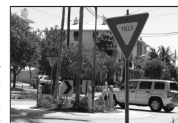
Roundabout in Pineapple Grove

For additional information, visit www.pbcgov.com , click on Publications and select Roundabout under Engineering .