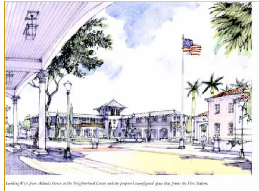
5 th Avenue Public Square