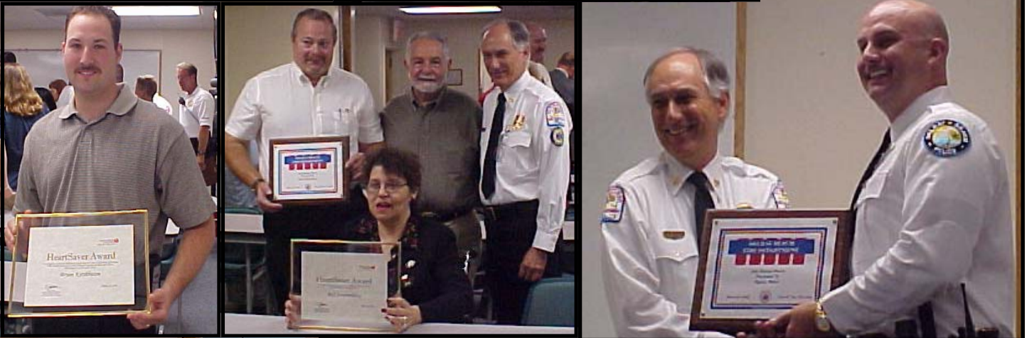
This Borton Volvo Team with the assistance of an AED saves a customers life.