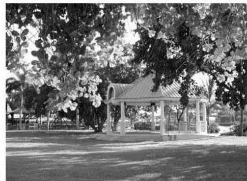
Veterans Park Gazebo

Welcome to Delray Beach the All-America City