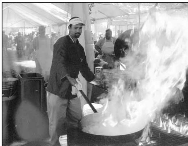
Flaming, Spicy Calamari are a tasty favorite at the Garlic Festival.

The Garlic Festival hours are: Friday, November 11th, 5:00 pm to 10:00 pm, Saturday, November 12th, 11:00 am to 10:00 pm and Sunday, November 13th, 11:00 am to 7:00 pm. Admission is $8.00 and children under 10 years of age are free. Parking will be available at the City Hall parking lots (free) and the South County Courthouse Garage for $5.00.