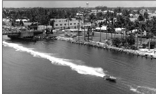
Veterans Park site looking west across the Intracoastal: 1965

There are 24 spacious, beautifully landscaped and very well maintained parks in Delray Beach. Every sector of the City has easy access to one or more of our parks that include playgrounds, nature paths, swimming pools, tennis courts, basketball and, at the Catherine Strong Park in the southwest area, a very popular water feature: a splash park. There are very active parks such as Pompey Park (our largest) and passive parks such as the recently opened Cornell Park in the Lake Ida district and the new Mike Machek Boy Scout Park on Lake Ida Road. Six new parks have been added for the pleasure of Delray Beach residents in the past two years.