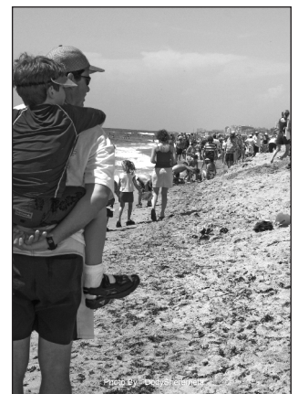
Delray Municipal Beach