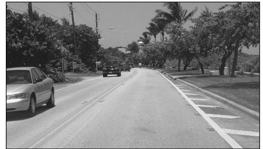
A1A narrow lanes.

Street lights along the public beach will be relocated, but the final decision on the type of illumination and standards to hold the lighting are still being discussed by the DOT and the Florida Fish and Wildlife Conservation Commission to ensure sea turtle protection. New mast-arm signals will be installed at Casuarina Road and at East Atlantic Avenue. Mid-block crosswalks will be provided at Atlantic Dunes Park, the Seagate Hotel location, Anchor Park, Ingraham Park, north of Atlantic Avenue and at the north end of the public beach.