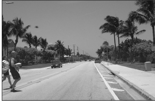
A1A (Ocean Blvd.) wide lanes.

State Road A1A is one of America's most beautiful coastal roads. In South Florida, it is one of the most traveled by residents and visitors to our many beaches as well as tourists taking the scenic route running from Key West to Fernandina Beach, just south of the Georgia border. This July, the resurfacing, restoration and rehabilitation of A1A through the Delray Beach area will begin. The work will extend from Linton Boulevard on the south to George Bush Boulevard in the north. The City water main replacement project, currently underway, should be completed by the end of this month. With that done the Florida Department Of Transportation (DOT) will be clear to proceed with their project along A1A.