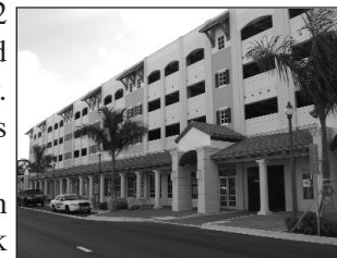
Old School Square Parking Garage

For further information please call (561) 243-7196 between the hours of 9:00 AM and 5:00 PM Monday through Friday.