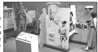
Spady Museum Fort Mose Exhibit

Experience the diversity of the African American community in Delray Beach by celebrating October Heritage Month. For more information please call the museum at 561-279-8883 or visit the website at www.spadymuseum.org . The museum is located at Northwest Fifth Avenue in downtown Delray Beach, one-and-a-half blocks north of Atlantic Avenue.