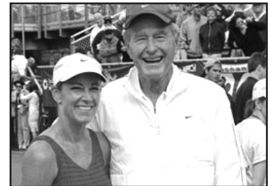
Chris Evert and Former President George H.W. Bush

For more information, please call (561) 394-2400 or visit www.chrisevert.org .