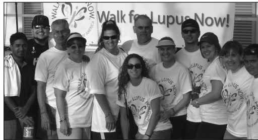
Participants from last year's event

The Lupus Foundation of America, Southeast Florida Chapter, encourages family and friends to gather in Anchor Park, Atlantic Avenue and A1A, on October 27, 2007 for the “Walk for Lupus Now”. Registration begins at 8:00 am with the walk immediately following at 9:00 am. Funds raised through this event provide support for lupus patients and their families, education for the medical community and general public and research for better treatment and an eventual cure.