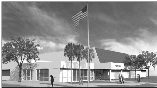
Pompey Park Expansion Project

The City is also selling $9,000,000 in Water and Sewer Bonds to Branch Banking & Trust at a rate of 4.41% for a period of 15 years. These bonds will provide financing for the City's share of the Reclaimed Water and Deep Well Projects. The reclaimed water treatment expansion and deep well injection projects are at the South Central Regional Wastewater Treatment and Disposal Board plant and are being done to get rid of the ocean out-fall (treated waste water now flowing off shore) per Florida Department of Environmental Protection permit requirements. This project's total is $18,000,000 with the funding to be shared between the Cities of Boynton Beach and Delray Beach.