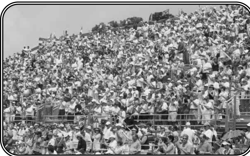
Big crowds expected for exceptional week of tennis at Millennium International Tennis Championships.

Mardy Fish, Olympic Silver Medalist, James Blake, Vince Spadea and Jan-Michael Gambill lead a group of world class tennis professionals who are scheduled to play in the 12th Annual International Tennis Championships at the Delray Beach Stadium and Tennis Center beginning on Monday, September 13, 2004.