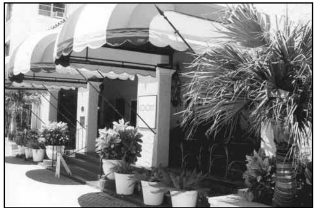
The historic Colony Hotel