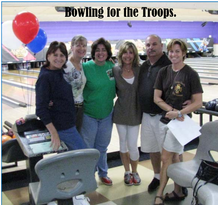
Bowling for the Troops.

This fundraiser was to raise money for Holiday "care packages" to deployed men and women serving in Iraq and Afghanistan. 100% of the proceeds will be donated for the Holiday packages.