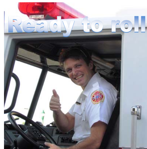
Ready to roll