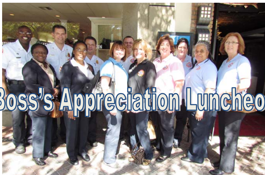
Boss's Appreciation Luncheon

“Our vision is to provide Fire-Rescue, Emergency Medical and Special Operations Services at the highest level of excellence, professionalism, and commitment to the community. Proud of our past and embracing our future, the members of Delray Beach Fire-Rescue will work as an effective and integrated team, dedicated to continuous improvement and maintaining a positive environment. The Department will be a model to others and the pride of the community”.