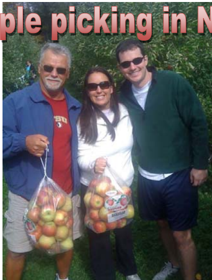
Apple picking in NY