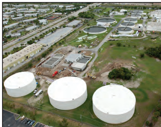
The South Central Regional Wastewater Reclamation facility is expanding its reclaimed water plant so it will be able to produce 10 million gallons of reclaimed water per day.

Delaire Country Club 2008 ~ 1.2 million gallons per day