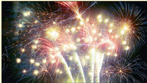
The city's fireworks display starts at 9 p.m.