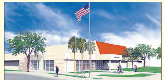
Improvements to Pompey Park, approved by voters, will continue.

At the same time, the city is monitoring the Legislature and looking for ways to reduce costs while maintaining quality services.