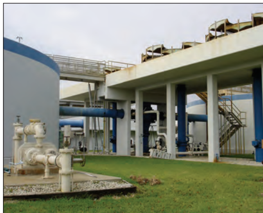
By increasing the number of homes and businesses that use reclaimed water for irrigation, Delray Beach will be able to reduce daily volume and add capacity to provide more drinking water.