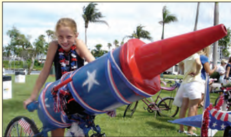
The Patriotic Bike & Scooter Parade begins at 4 p.m.