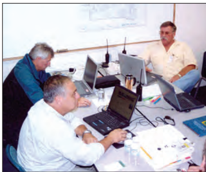
During a storm, city employees staff the Emergency Operations Center at the main fire station and coordinate efforts.