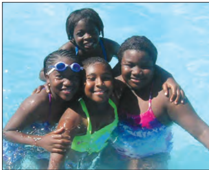
A visit to the Pompey Park pool is one of many activities enjoyed by campers.

"They're here in a safe and secure environment where they're playing and having lots of fun," he said. "And they're learning."