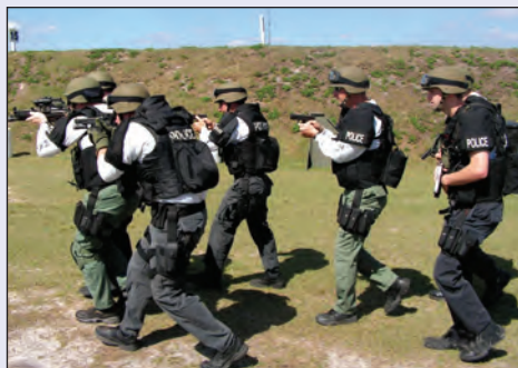
Delray Beach Police Department officers train for mass-casualty events.