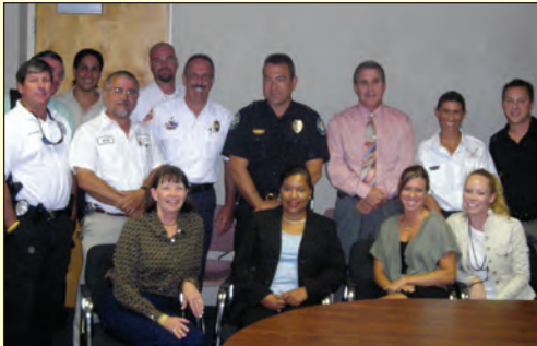
A minimum of 15 people, representing several city departments, plan the city's Fourth of July Celebration.

"The city staff take a lot of pride in this event," she said.