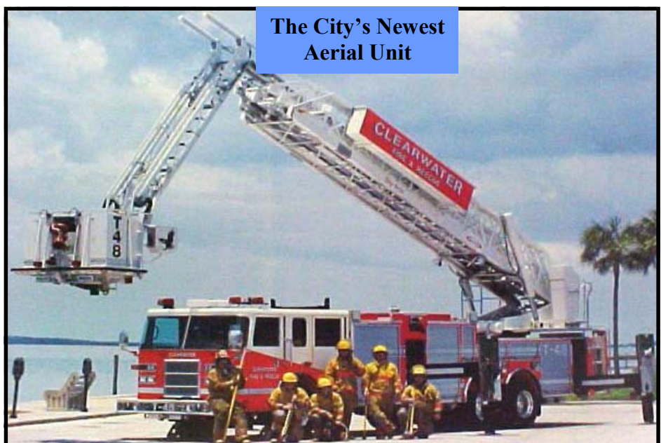
The City's Newest Aerial Unit